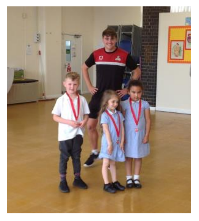
3 - Doncaster Rovers

We had so much fun experiencing what a sports coach does with the team from Club Foundation Doncaster.