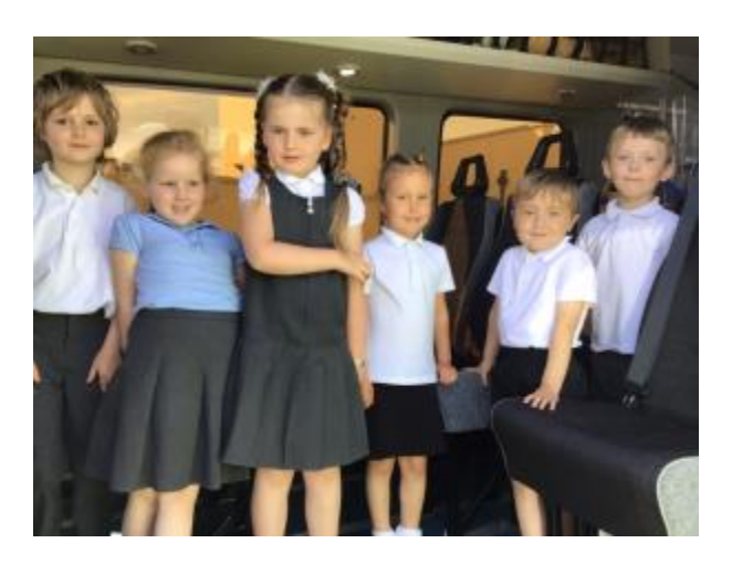
Reception have enjoyed having their own police station outside in the EYFS area with all the role play resources purchased from the grant funding.