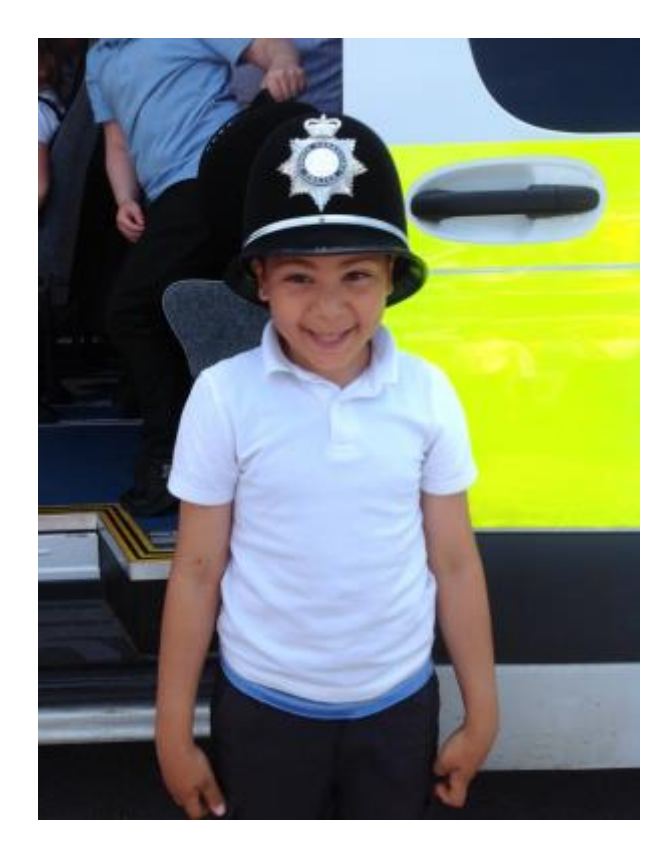
Everyday can be totally different from warrants to look around houses, chasing robbers, helping ambulances and stopping fights. On average they deal with 10 to 20 crimes a day!