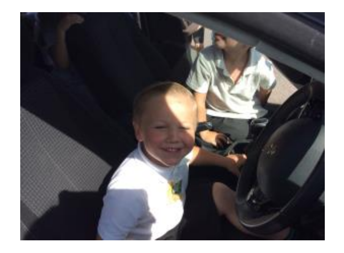
We had a great day with the police, they joined us for lunch and played football with us at lunchtime too!